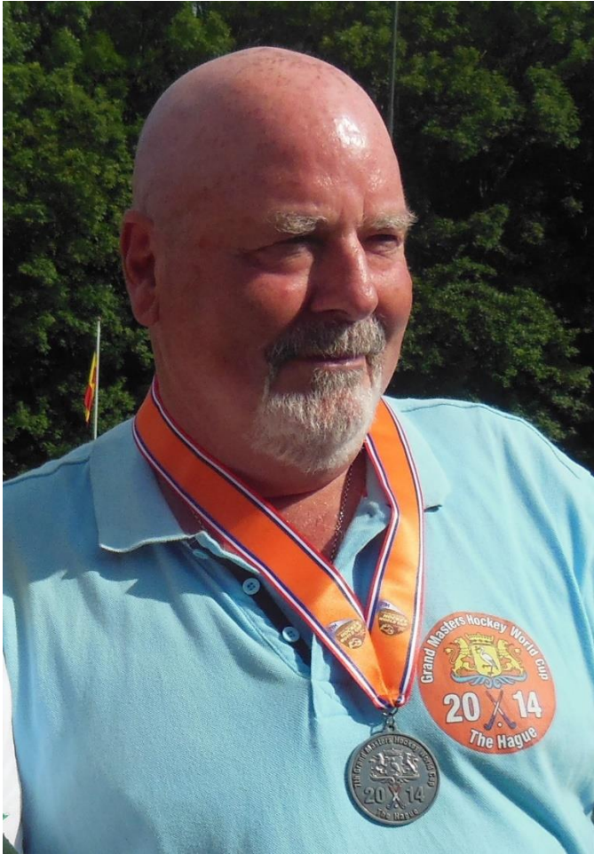
Main photo 1