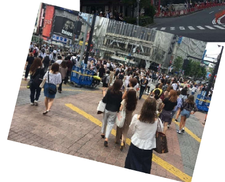
Images from Shibuya